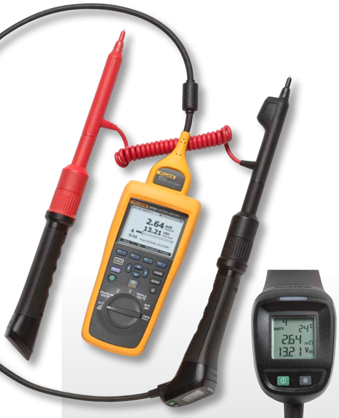
Intelligent test probe with integrated LCD display