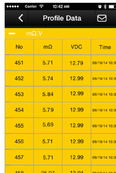
View and email measurement data.