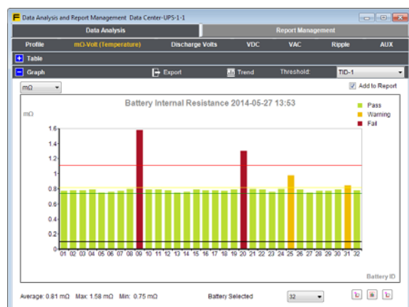
Histogram of a battery string with user defined threshold.