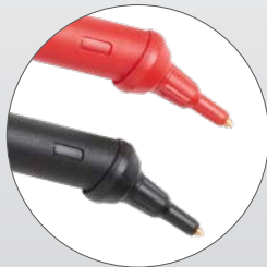
BTL20ANG Angled Measurement Probes